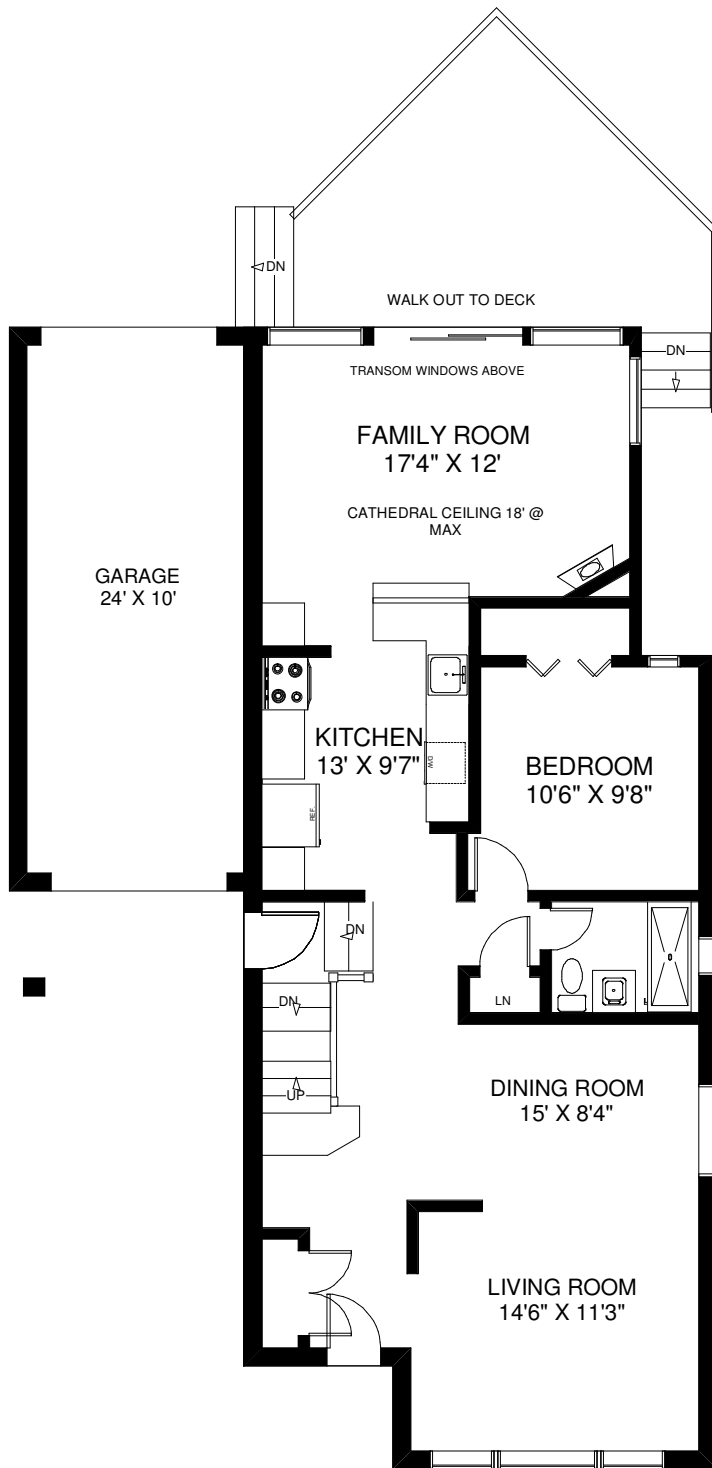
MAIN FLOOR APPROXIMATELY 1,100 SQ FT